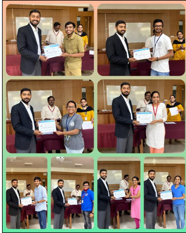
Distribution of certificates