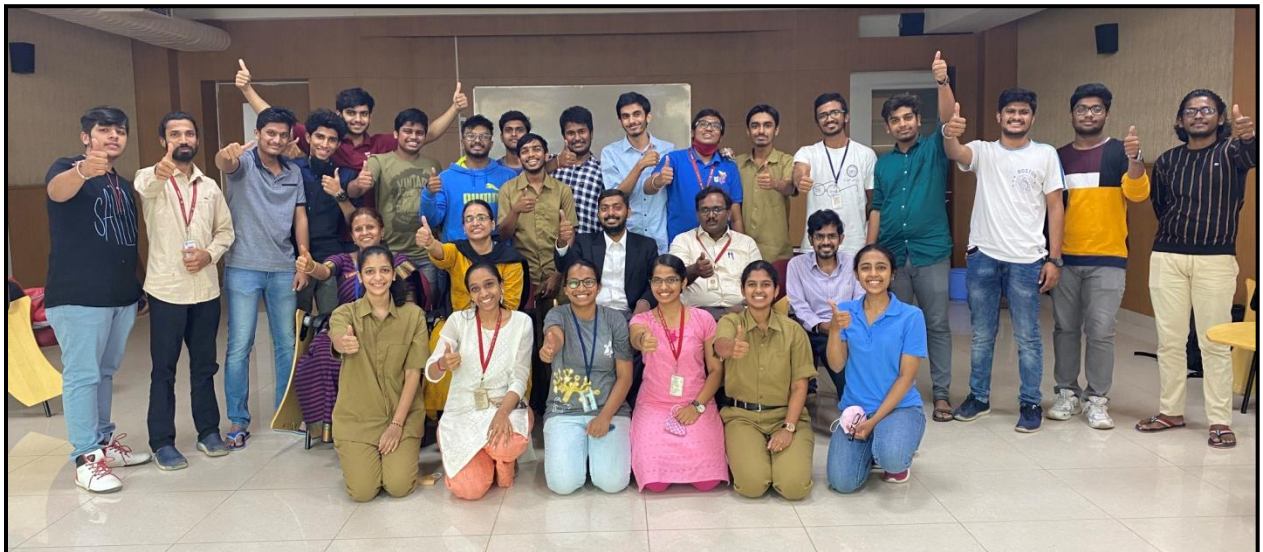
Group photo with the Speaker