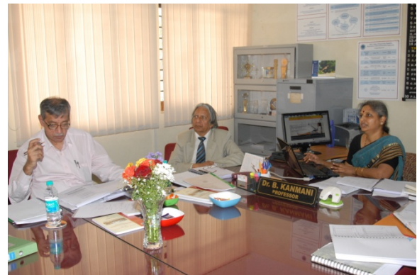
UG Program in Computer Science & Engineering