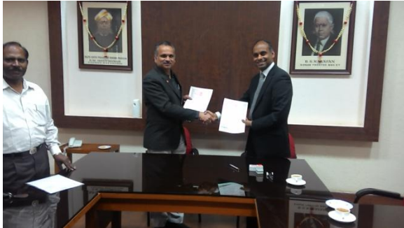
Feb 04: Visit of Team FluxGen with Micro Energy International, Berlin to BMSCE Campus