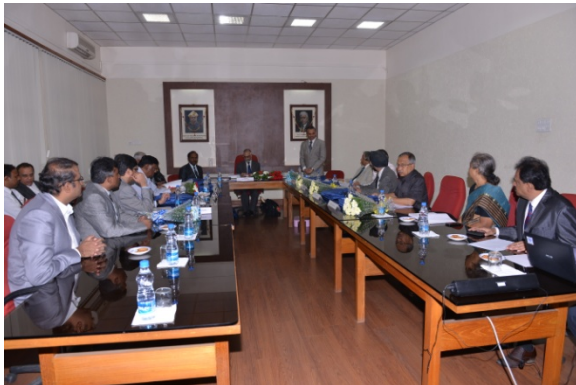
UG Program in Electrical & Electronics Engineering