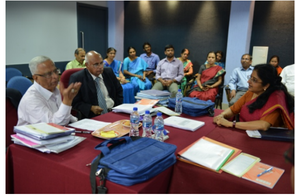
UG Program in Telecommunication Engineering

Feb 14-16: NBA Expert Team visited BMSCE for evaluating UG programs in EE, TE, CS & IS. This evaluation is Tier-I category (new format). BMSCE has the unique distinction of this accreditation as the institution is the first one to opt for such kind which is based on Outcome Based Education. This marks completion of 09 UG programs in Engineering out a total of 12