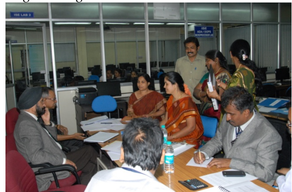
UG Program in Information Science & Engineering