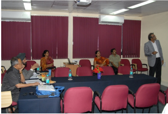
Discussion with BOG & Academic Council members