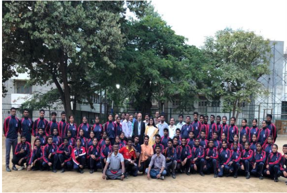
Volunteers from more than 25 Universities across the state participated in the camp and performed Parade at Field Manekshaw Parade Ground, Bengaluru on Republic Day