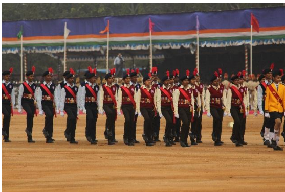
Our State NSS Contingent received Second Prize for March-past conducted at Field Manekshaw Parade Ground, Bengaluru on Republic Day