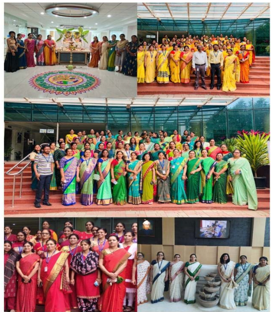
BMSCE WOMEN CELL, BANGALORE