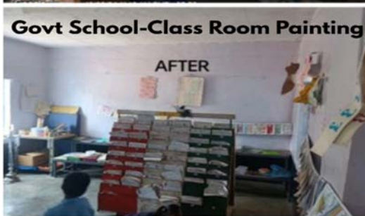
Govt School-Class Room Painting

✚ Around 40 students of first semester MCA volunteered and hosted dance and music performance during the Food Fest called “Experience Millets” presented by the BIG Foundation and IMS Foundation in collaboration with Laghu Udyog Bharati at the college premises during March 16-17, 2024.