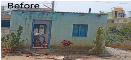
School Kitchen Renovation