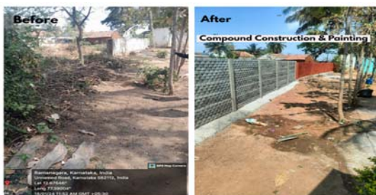
Compound Construction & Painting