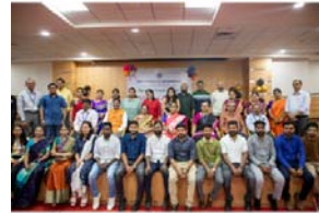
Alumni Batch 2016-2018