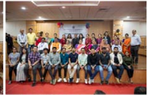
Alumni Batch 2019-2023