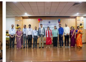
Mr. Alumni & Ms. Alumni awardees