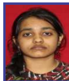
GOIPKA D 1ST RANK