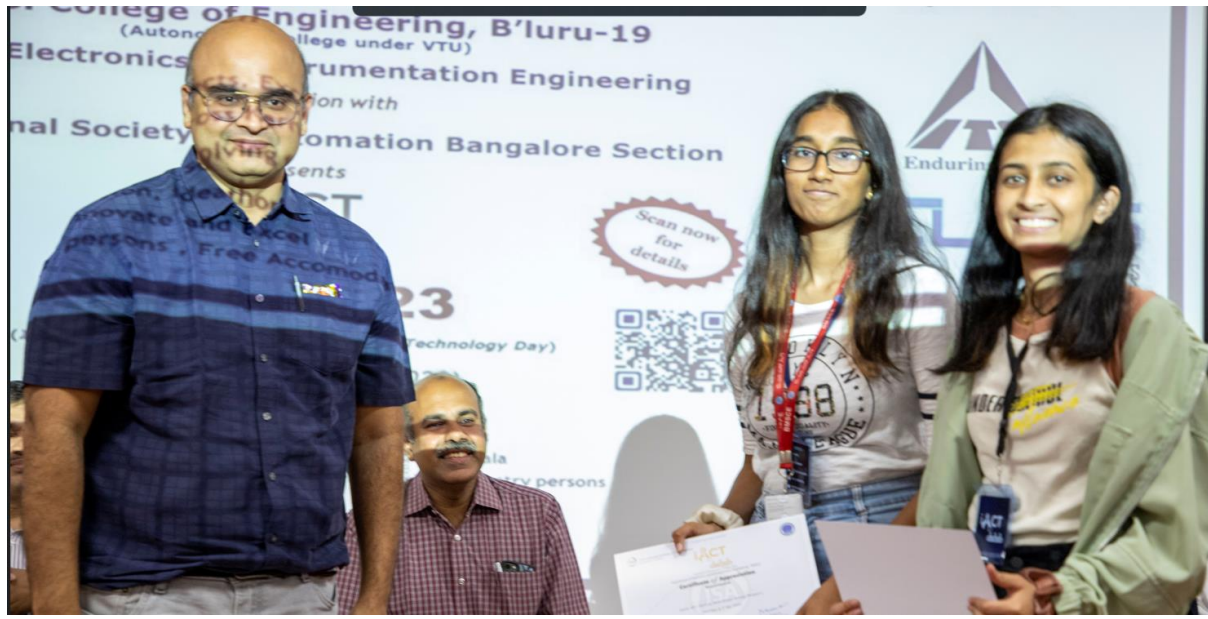
Volunteers being given Certificates at IACT 2023