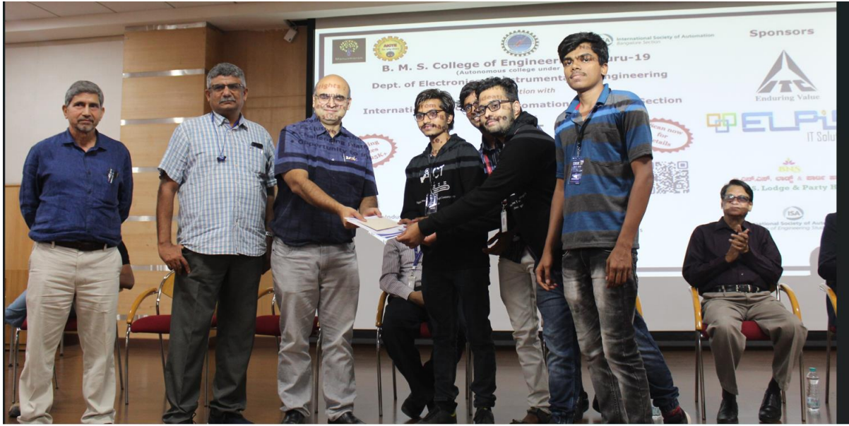
Winning team Being felicitated at IACT 2023