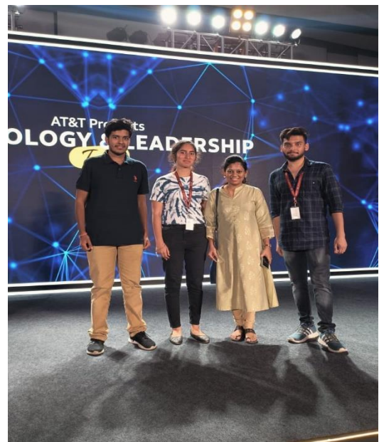
Students of BMSCE at AT & T